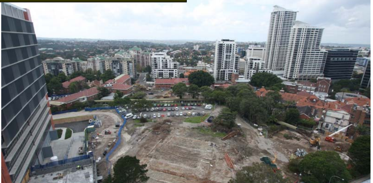
View of the construction site from the old Brown Building