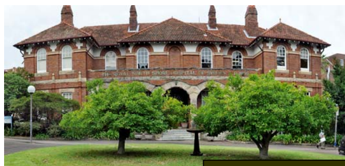
The Vanderfield Building

The Vanderfield Building's significance has been recognised and any reuse of the buildings in the heritage precinct is required to be sympathetic to their location, context, history and character.