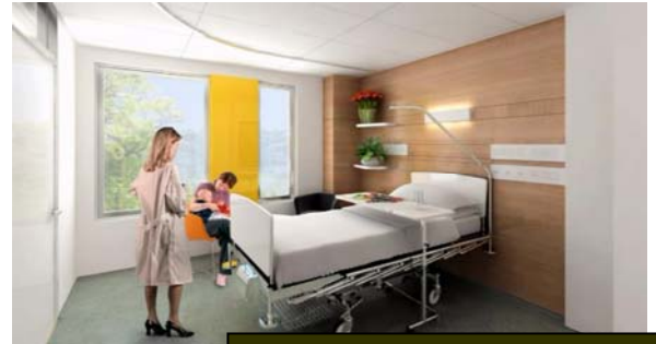
A patient room in the new hospital

For people with access to the internet, the video is now available on the hospital website (see below).