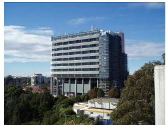
Above: The façade emerges from its scaffolding.

R&E Fast Fact: The top floor of the R&E Building is level with the top of the Sydney Harbour Bridge!